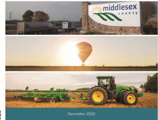
Middlesex County Economic Development Strategy Update 2021-2025